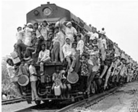
From the web site: Some trains even have people sitting and lying on top!

The seed money donated for our Media Initiative inspired this redesign. We hope many Minnesota Public Radio listeners will be attracted to our site in the coming weeks after hearing our announcements.